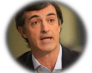
Official Opening by Argentina's Minister for Education Sr. Esteban José Bullrich