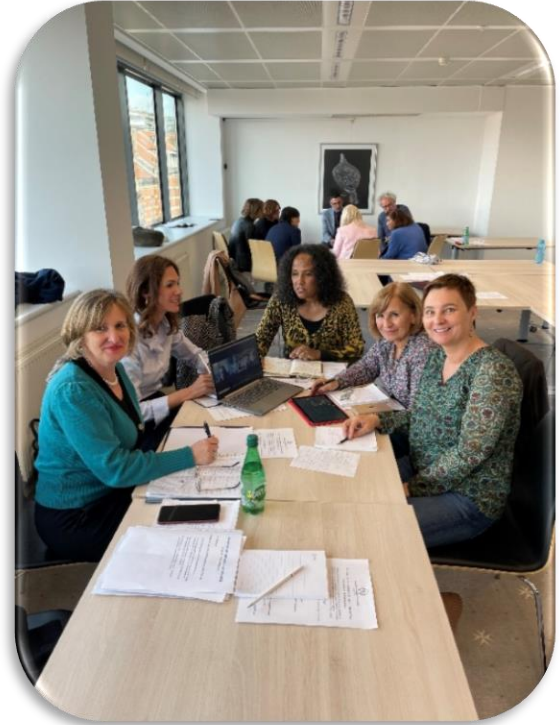
Advocacy Working Group