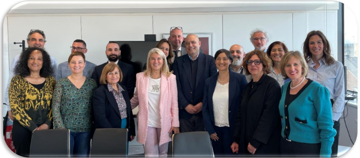
IAC Europe Meeting Attendees – Brussels, April 2023

IAC Europe is one of six active IAC Regions.