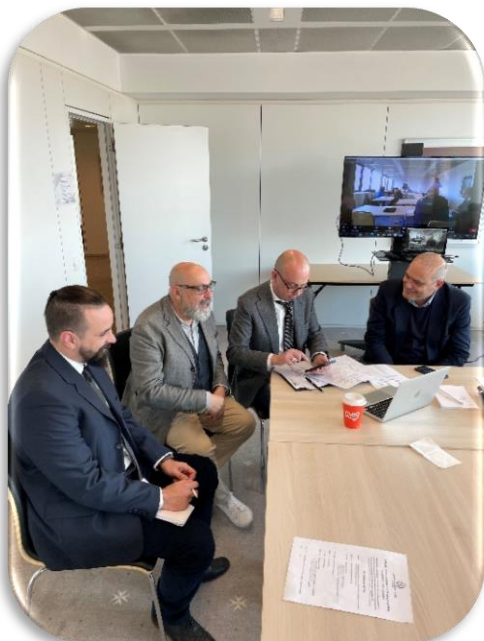
Governance Working Group