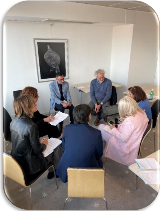
Standards Working Group